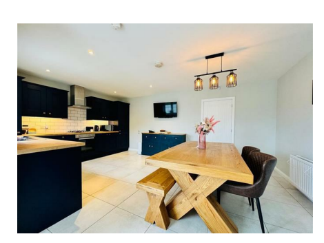
11 Hydepark Mews Mallusk, Newtownabbey, BT36 4SE