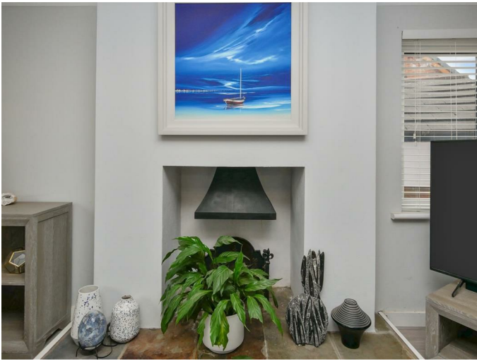
Living Room 12'8 x 10'3 (3.86m x 3.12m)